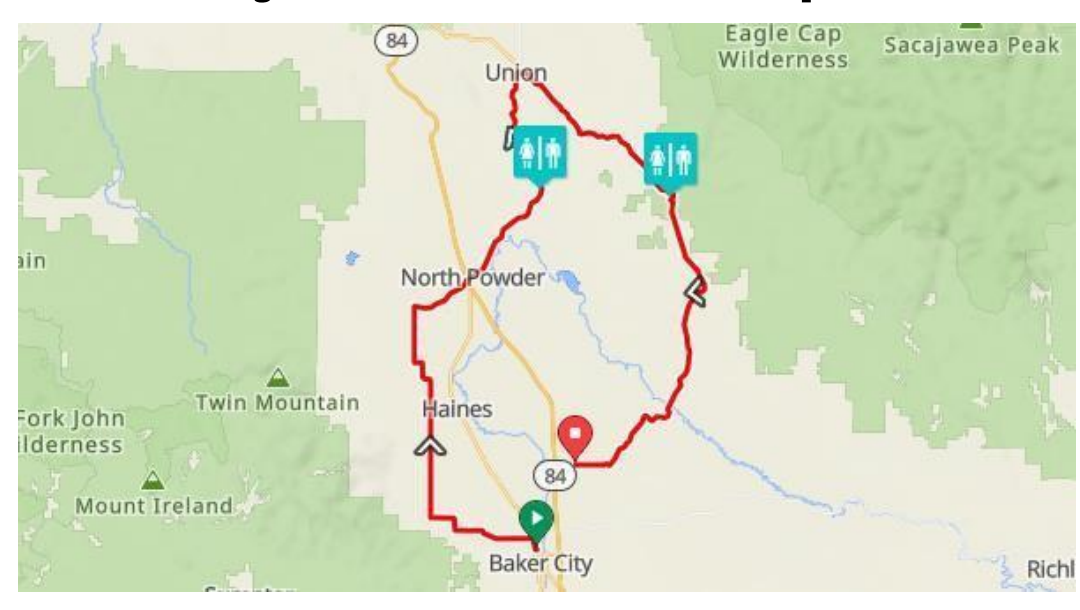
Stage 1 Catherine Creek Road Race Map

Number Placement: Number placement is the same for Stages 1 and 4. Place one of your assigned numbers horizontally across the left pocket area and the other one of your assigned numbers vertically on your right side.